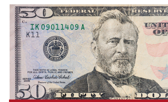
Four $50 cash drawings each day for members who attend