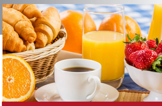
Free breakfast for political action members Oct. 11

already a member, you can sign up at the event or do so beforehand by calling us Monday through Friday from 7:30 a.m. to 4 p.m. at 800-962-3830. Your contribution of $2.08 per month helps us support candidates who fight for reliable and affordable electricity.