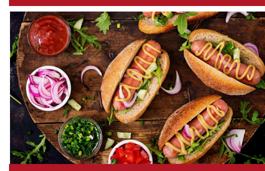
Free lunch for all members Oct. 11 and 12